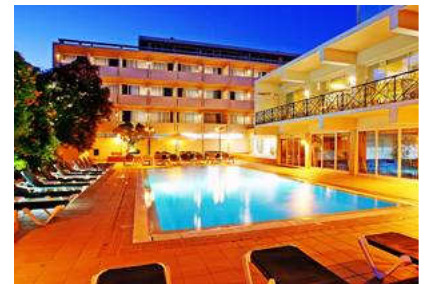
Hotel Estoril pool

Tours 4 sport 0800 0433887 info@Tours45sport.com