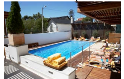
Hotel Monte do Estoril pool