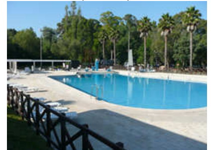
pool at Lisbon holiday park