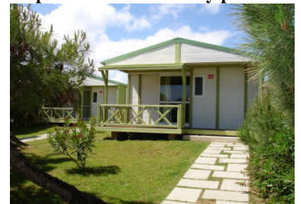
Guincho holiday park